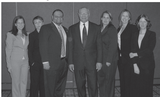
PLC volunteers with Gen. Colin L. Powell at the ACCA-SoCal Gala Dinner.

On February 10, 2006, ACCA-SoCal held its 11th Annual Gala Dinner , with Distinguished Speaker General Colin L. Powell, USA (Ret.). At the dinner, ACCA-SoCal held its annual Pro Bono Silent Auction with the proceeds to benefit Public Counsel in Los Angeles and PLC. The auction resulted in a donation of $8,550 to PLC. PLC is extremely grateful for ACCA-SoCal’s continued support. ↙